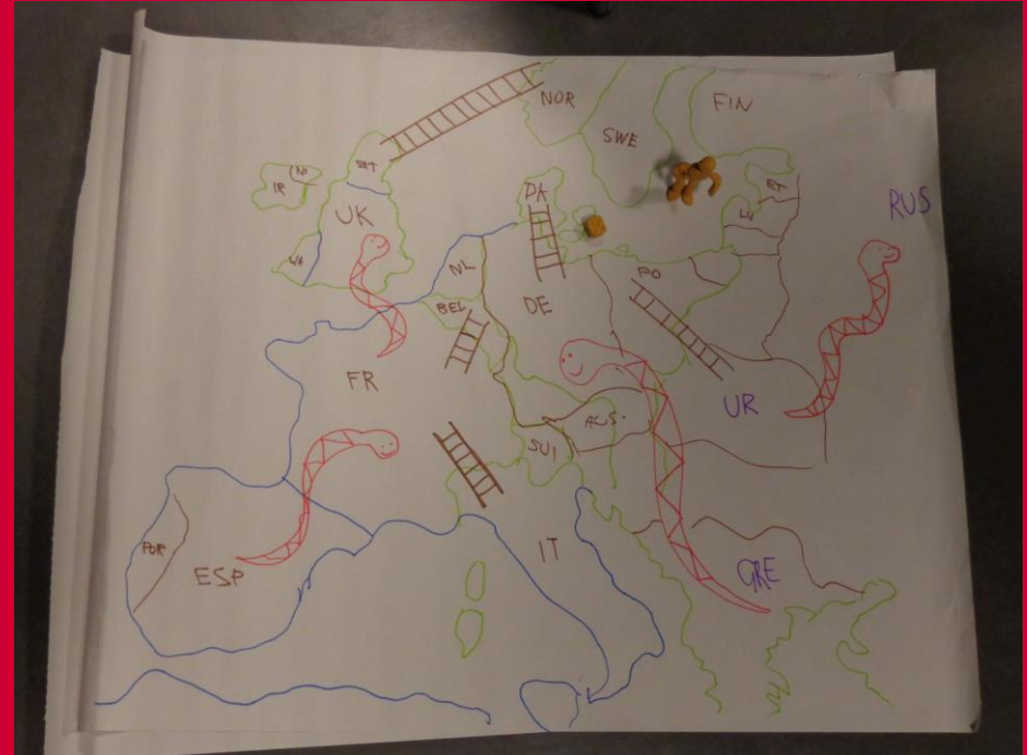
Europe: Snakes and Ladders, Residential 1, Ypres, 2015