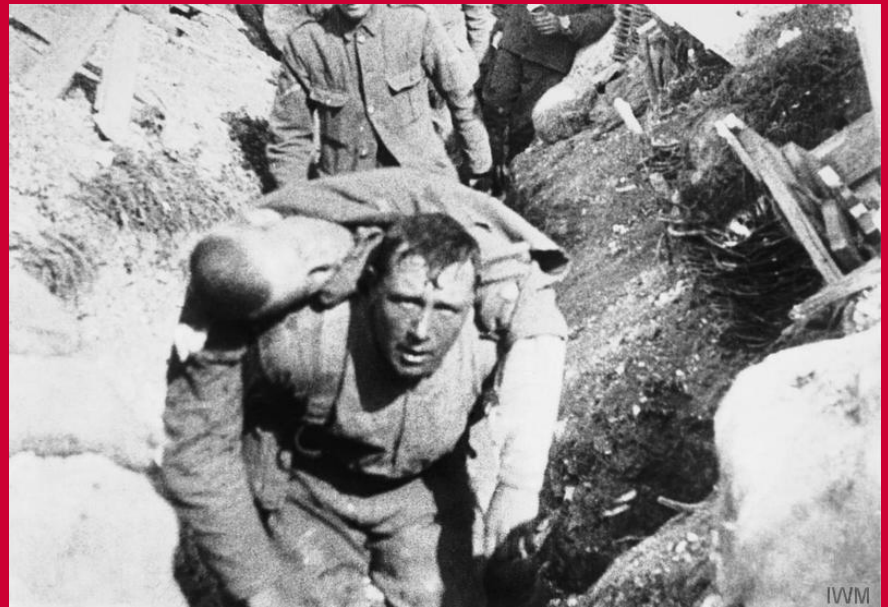
Still from "The Battle of the Somme" 1916