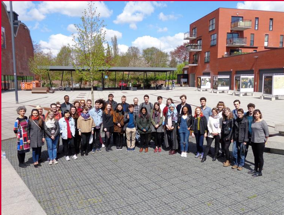
Make Film, Make History Residential 1, Ypres, Belgium 2015