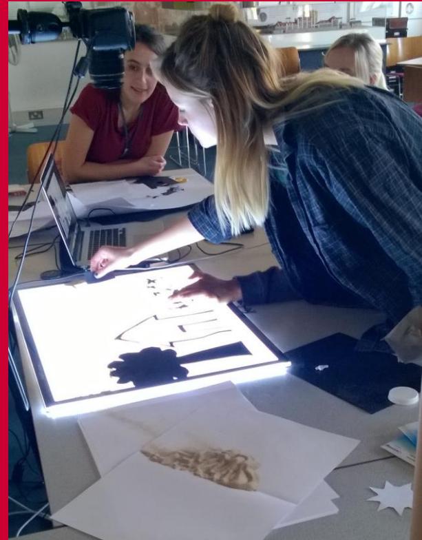
Film development meeting in London Dec 2015